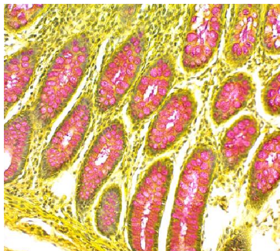
Epithelial mucins in Human GI tract demonstrated with Mucicarmine Stain Kit