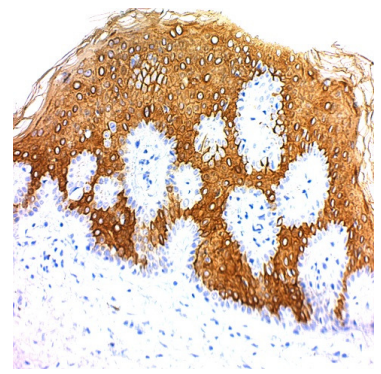
Human Skin Stained with Cytokeratin 10; Clone DE-K10 using UltraTek HRP and DAB Chromogen. 200X Magnification