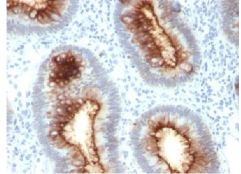
Formalin-fixed, paraffin embedded human Colon Carcinoma stained with CEA; Clone C66/1030.

Uses/Limitations: Not to be taken internally. For Research Use Only. This product is intended for qualitative immunohistochemistry with normal and neoplastic formalin-fixed, paraffin-embedded tissue sections, to be viewed by light microscopy. Do not use if reagent becomes cloudy. Do not use past expiration date. Non-Sterile.