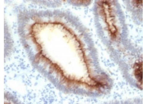
Formalin-fixed, paraffin embedded human Colon Carcinoma stained with CEA; Clone SPM330.

Uses/Limitations: Not to be taken internally. For Research Use Only. This product is intended for qualitative immunohistochemistry with normal and neoplastic formalin-fixed, paraffin-embedded tissue sections, to be viewed by light microscopy. Do not use if reagent becomes cloudy. Do not use past expiration date. Non-Sterile.